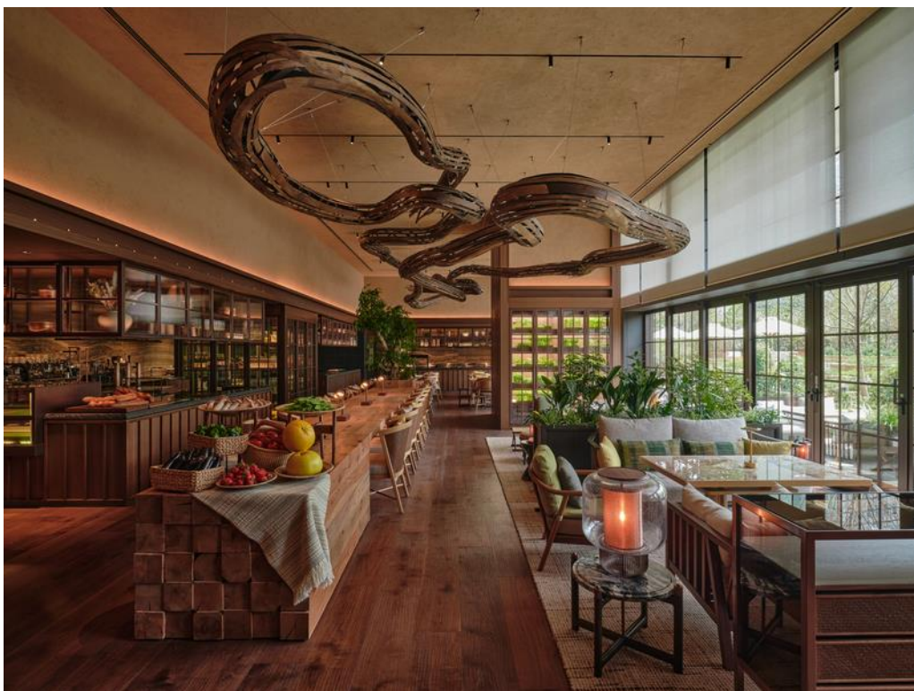
P72 Signature Restaurant