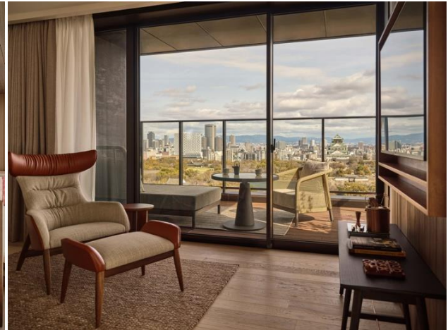
Patina Osaka Junior Suite

Situated between two historical treasures—Osaka Castle and Naniwanomiya Park—the 20-storey property was designed to be in harmony with its surroundings through the visionary collaboration of Jun Mitsui & Associates Architects and the masterful interior designers at Strickland. The design celebrates the Japanese concept of kisetsukan (seasonal awareness) while integrating elements from Osaka Castle's architecture—from the water flowing through its moat to the copper adorning its roof—creating a seamless blend of heritage and modernity.