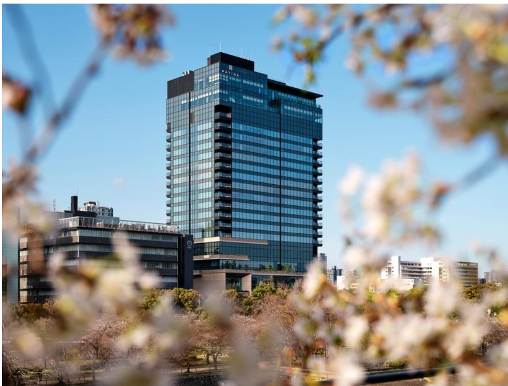
Patina Osaka exterior

Capella Hotel Group expands Patina brand with first urban property in Osaka