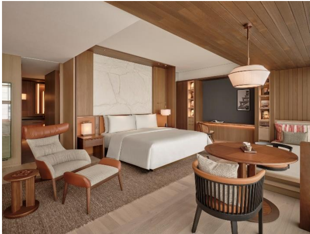
Patina Osaka Deluxe Suite